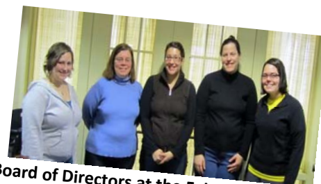
The Board of Directors at the February 2011 Face to Face Meeting in Columbus, OH.

The Board would like to thank all those who have and continue to volunteer with the Foundation. We can't do it without you!