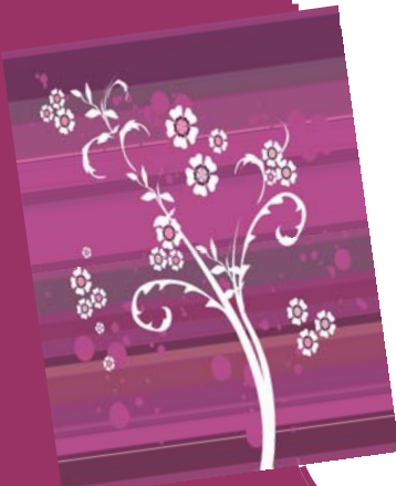
The Pennsylvania State University Phi Sigma Rho-Lambda Chapter