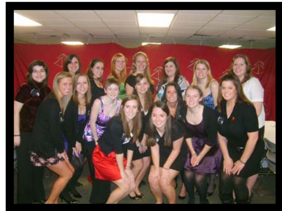
University of Dayton, Gamma Chapter Recruitment